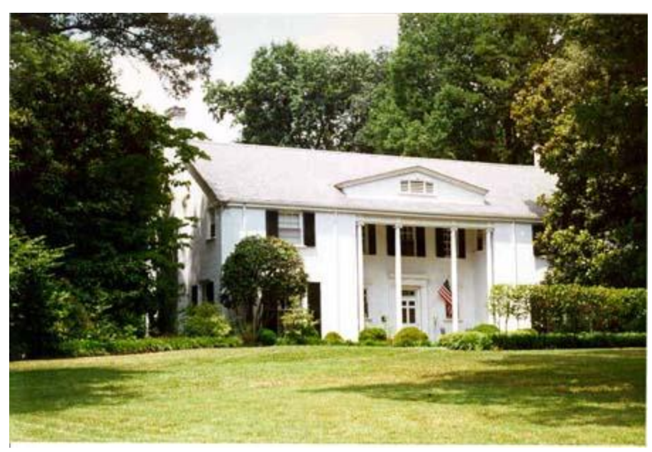
John Crosland House

The Club Acres streets today reflect their long history. Under the tall trees planted in the 1910s there is now an unusually diverse array of houses, with architectural influences ranging from Bungalow to Ranch. The area retains the prestige it has enjoyed since the 1930s, and likely will keep its present appearance for years to come.