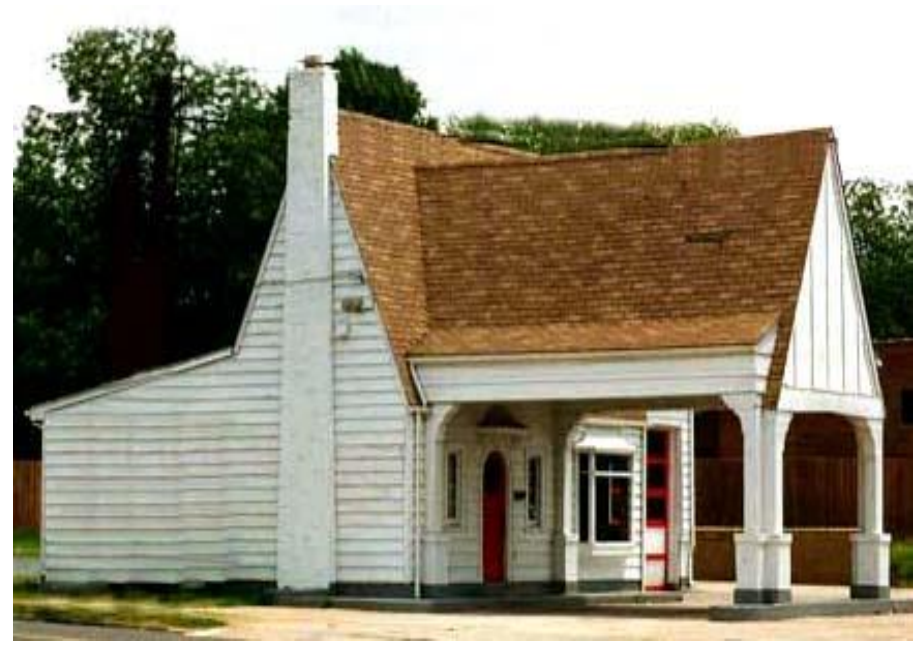
Pure Oil Gas Station

Trolley service ended in Charlotte in 1938, but the Central Avenue business district continued to grow for another fifteen years. <sup>70</sup> Businessmen felt it made sense to locate in an established shopping area. Among the newcomers was an early drive-in ice cream stand, the Dairy Queen at Central and Pecan. The 1951 building with rounded corners and subtle strips of decorative neon, blends Art Deco and International style architectural influences and is one of Charlotte's best surviving examples of auto-oriented design. A block up the street was another notable example of the same architectural influences. Architect M. R. Marsh's Plaza Theatre (now destroyed) dated from 1945-46, one of a number of neighborhood movie houses that appeared in the city in the 1940s. <sup>71</sup>