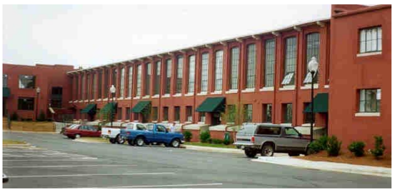
Atherton Cotton Mill

In his desire to make his suburb a complete community, Latta also included an industrial area. The land at the western edge of the development, between South Boulevard and the present Southern Railway quickly became what might be termed Charlotte's first suburban industrial park. Many notable early structures are still standing. At 2136 South Boulevard is D. A. Tompkins' <u>Atherton cotton mill.</u><sup>17</sup>