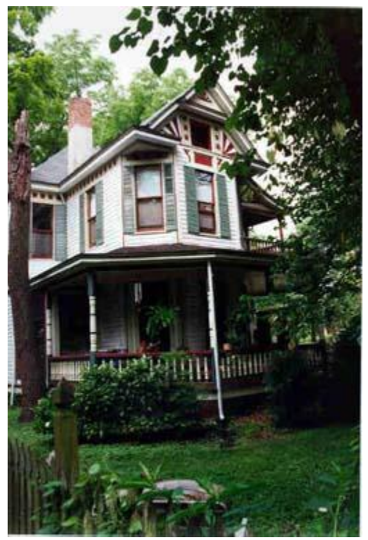
The Mallonee-Jones House

Among the noteworthy residences remaining is the <u>Mallonee-Jones House</u> at 400 East Kingston. Constructed in 1895, it is one of the city's best examples of the Queen Anne Victorian style with its distinctive "sunburst" gables. <sup>9</sup>